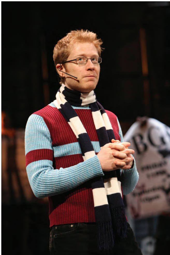
Anthony Rapp as “Mark Cohen” in Rent: The Broadway Tour .

StageNOTES: As an original cast member of Rent , you were involved with the workshop that created what we experience today. What was that like to be in it from the beginning?