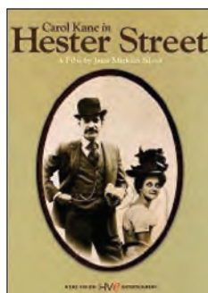
Early 20th Century

While some of you may never visit the Lower East Side, a great number of films set there provide a good sense of its changing flavor throughout the years. Get a feel for its changing history. Watch the following three films. Isn't it interesting how things have changed?