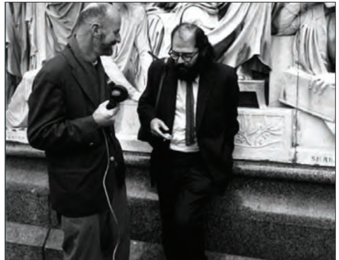
Allen Ginsberg (1926-1997), voice of the Beat Generation, is being interviewed by fellow poet Lawrence Ferlingetti on the steps of the Albert Memorial in London.

The streets are still lined with cafés and shops and although the creative souls who helped to form the neighborhood are no longer able to afford to live in it, the vibe and energy they helped to establish still exists to this day.