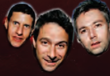
THE BEASTIE BOYS